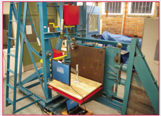
Typical test set-up on shock machine.